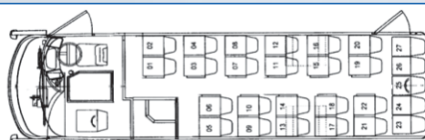
28 + 1 Seats