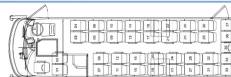
38 + 1 Seats